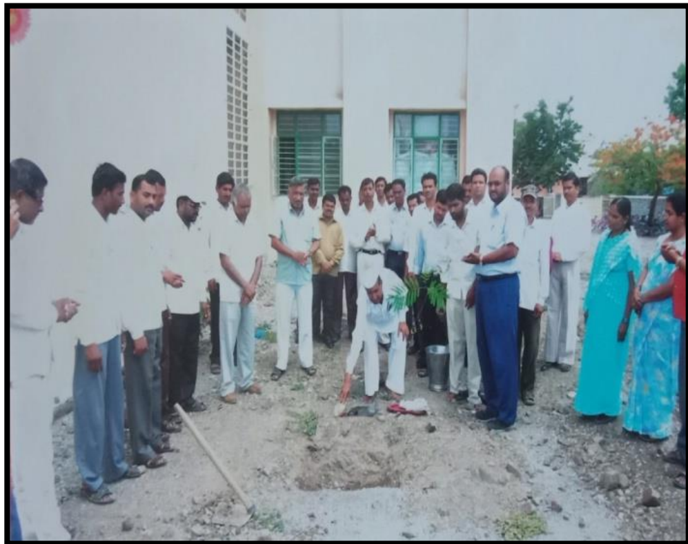
Actual photograph of tree plantation on the occasion of birth anniversary of any great person