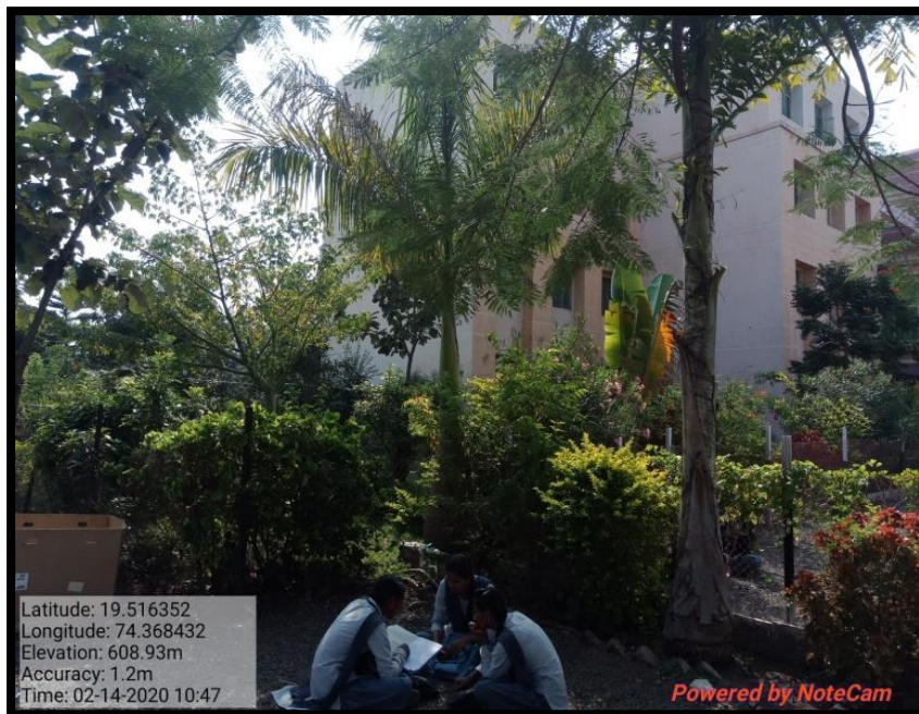
Actual photographs of green campus of institution