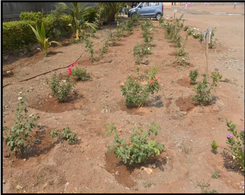
Actual photograph of rose garden developed in the institution