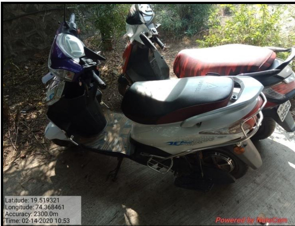
Actual photographs of battery powered vehicles