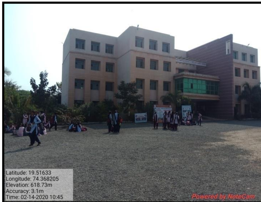
Actual photographs from Main gate to building area