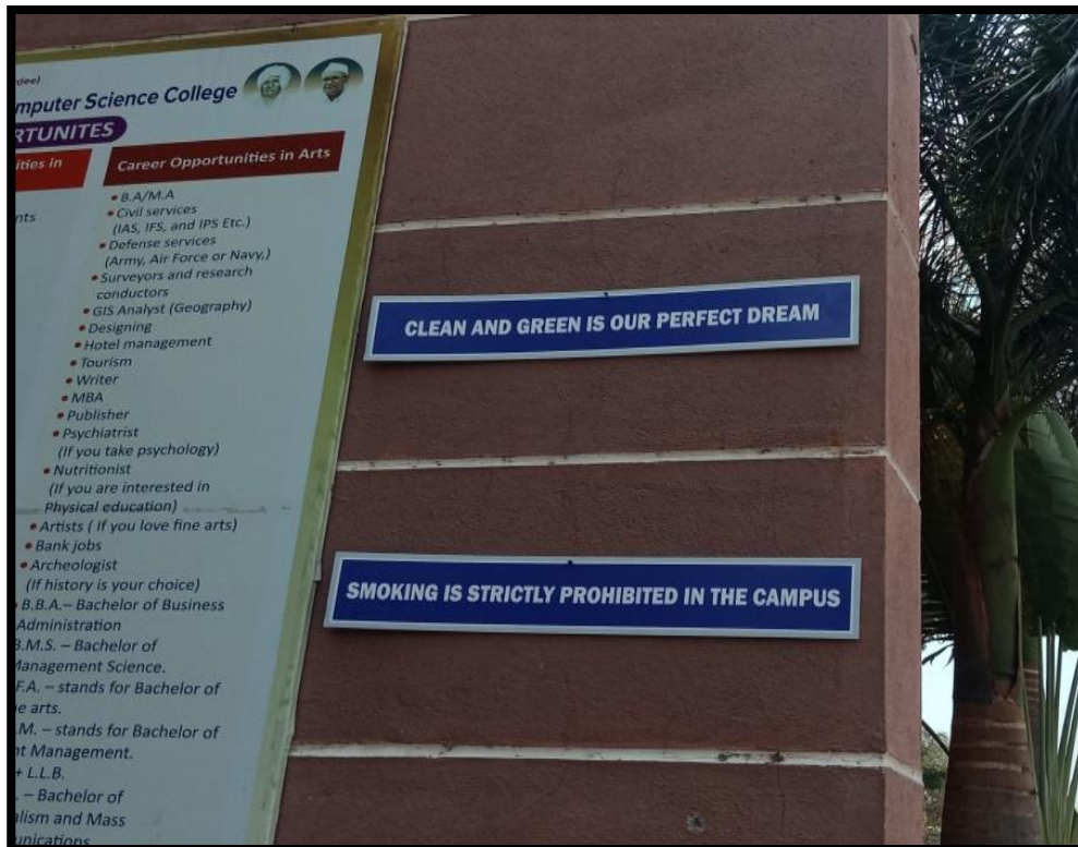
Actual photograph of display boards in order to maintain the green campus