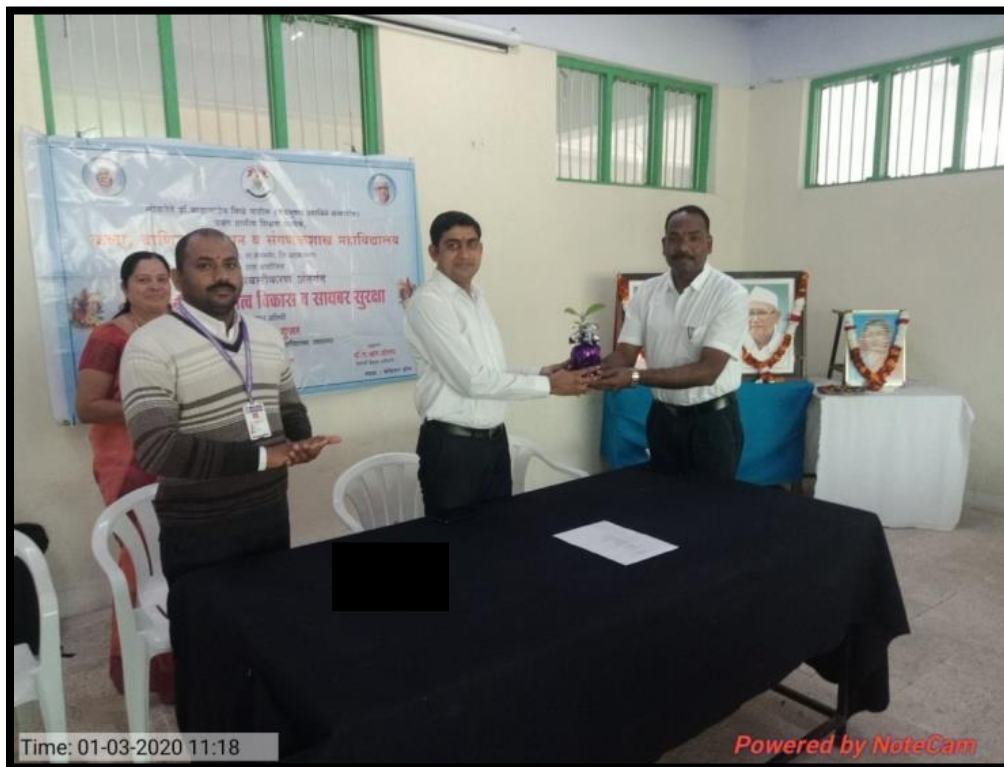
Actual photograph of plant is offered to dignitaries as a token of respect