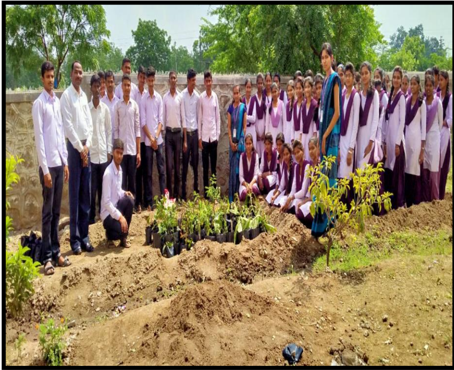
Actual photograph of nursery development in the of institution