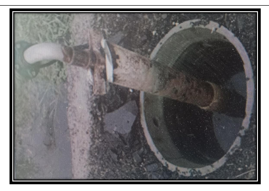
Water Conservation through Bore Well Recharge System