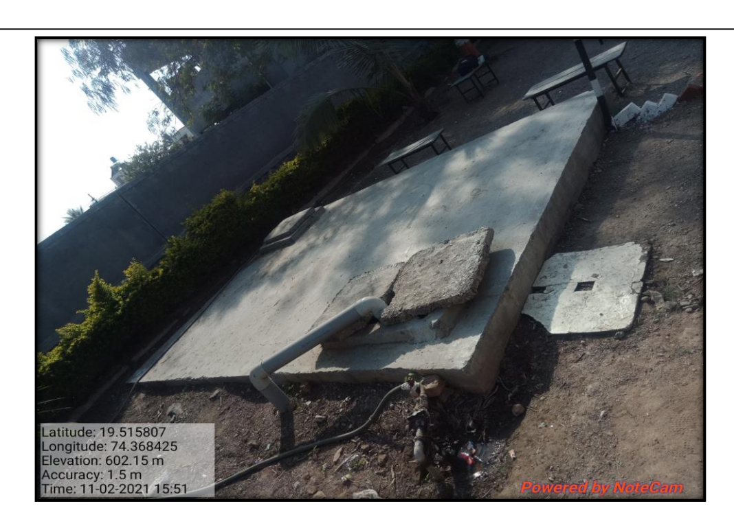
Tank constructed for Water Collection

Maintenance of water and effective Water distribution System