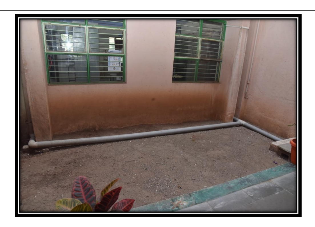
Rain Water harvesting unit for Water management