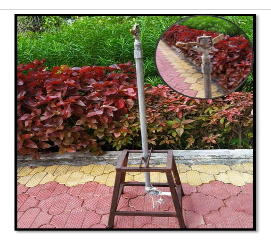
Photograph of portable sprinkler used for effective water management