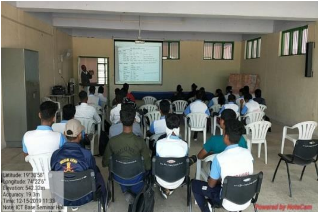
ICT- Seminar Hall- F-3 (First Floor)-15/12/2019