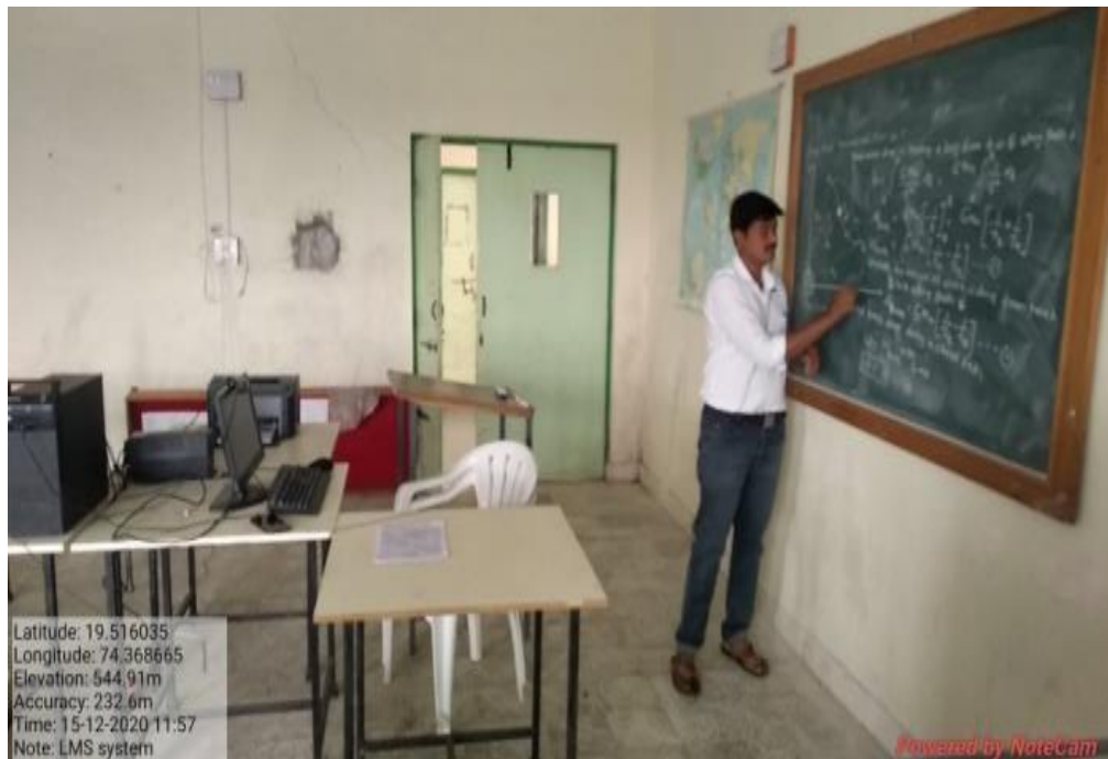
ICT- Smart class LMS -T-7- Dept. of Geography-15-12-2020