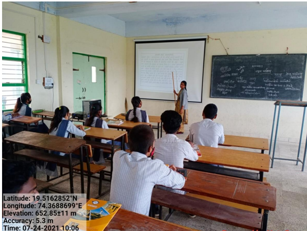
ICT- Classroom- Block No- S-6 (Second floor)-24/08/2019

Latitude: 19.5162852°N Longitude: 74.3688699°E Elevation: 652.85±11 m Accuracy: 5.3 m Time: 07-24-2021 10:06