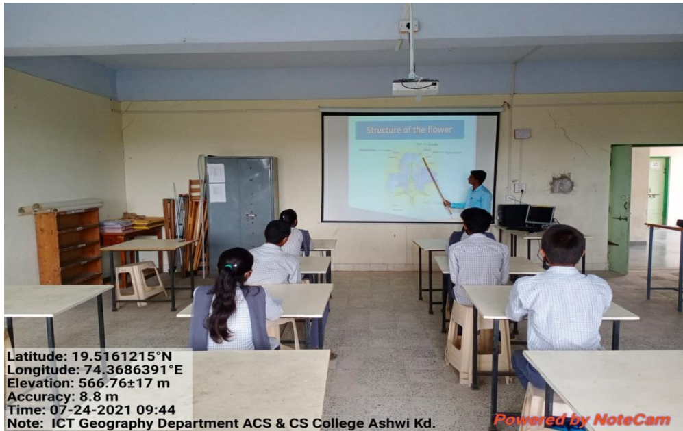
ICT- Department of Geography- Block No- T-7 (Third floor)-24/07/2021