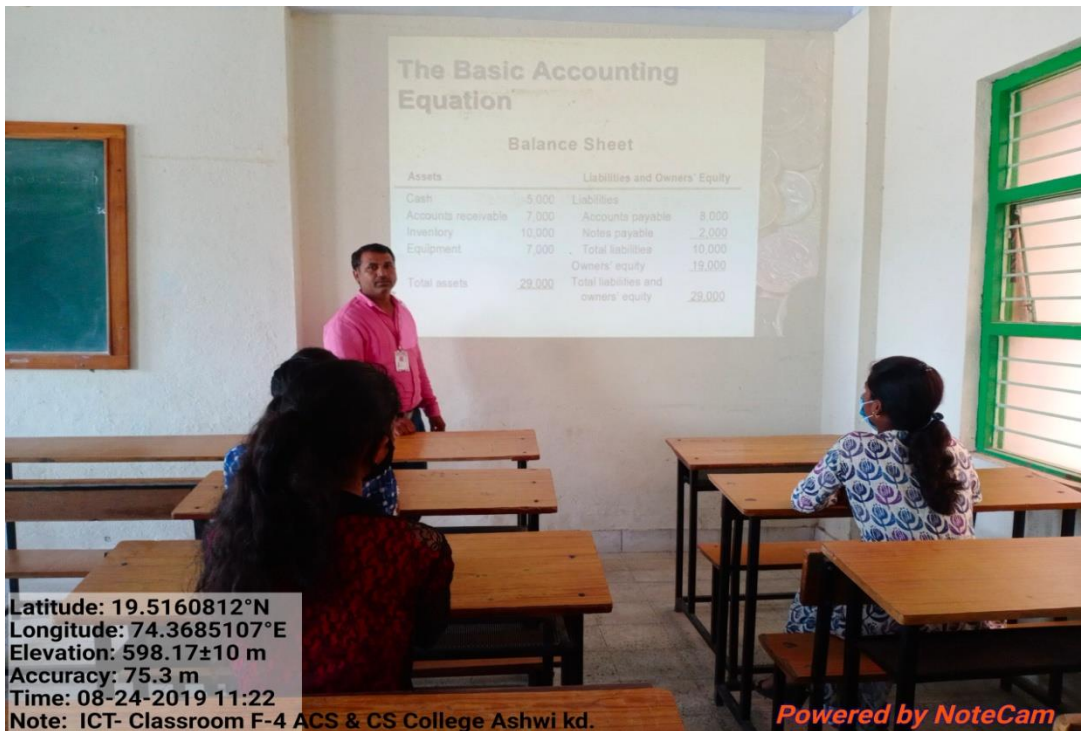
ICT- Classroom- Block No. F-4 (First floor)-24/08/2019