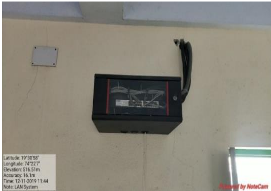
ICT- LAN System-12/11/2019