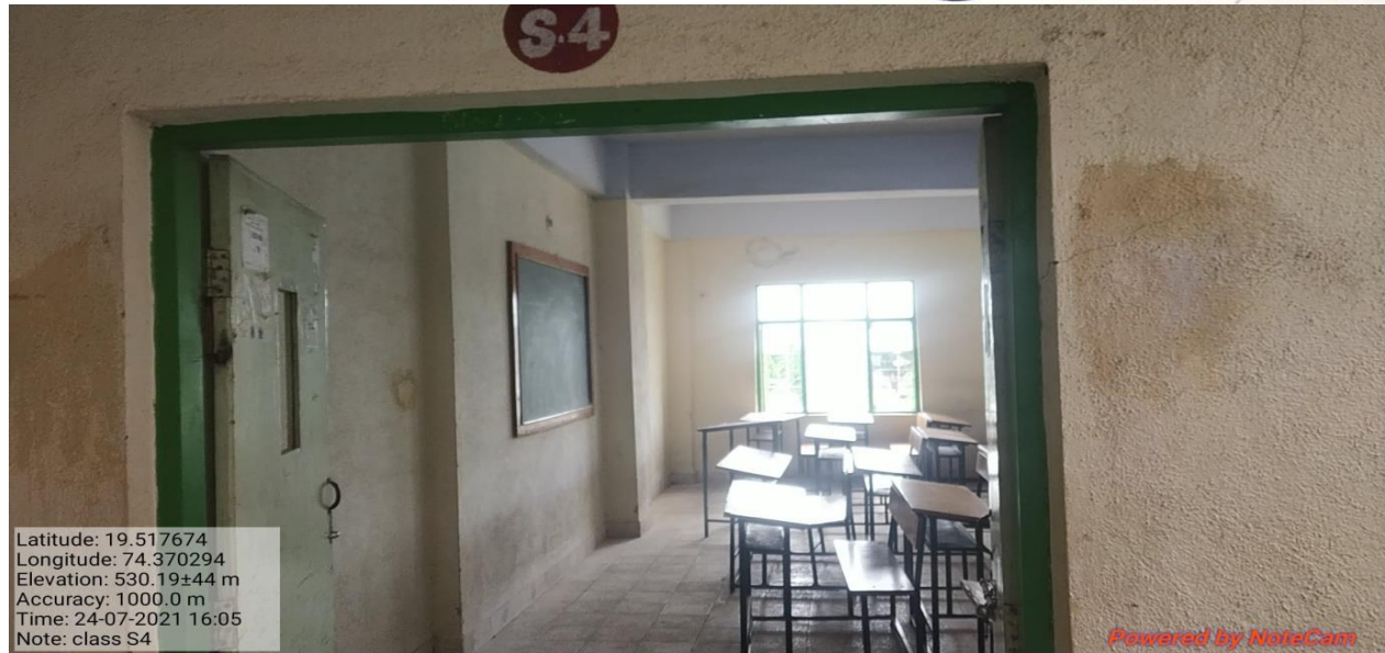
Class – S-4