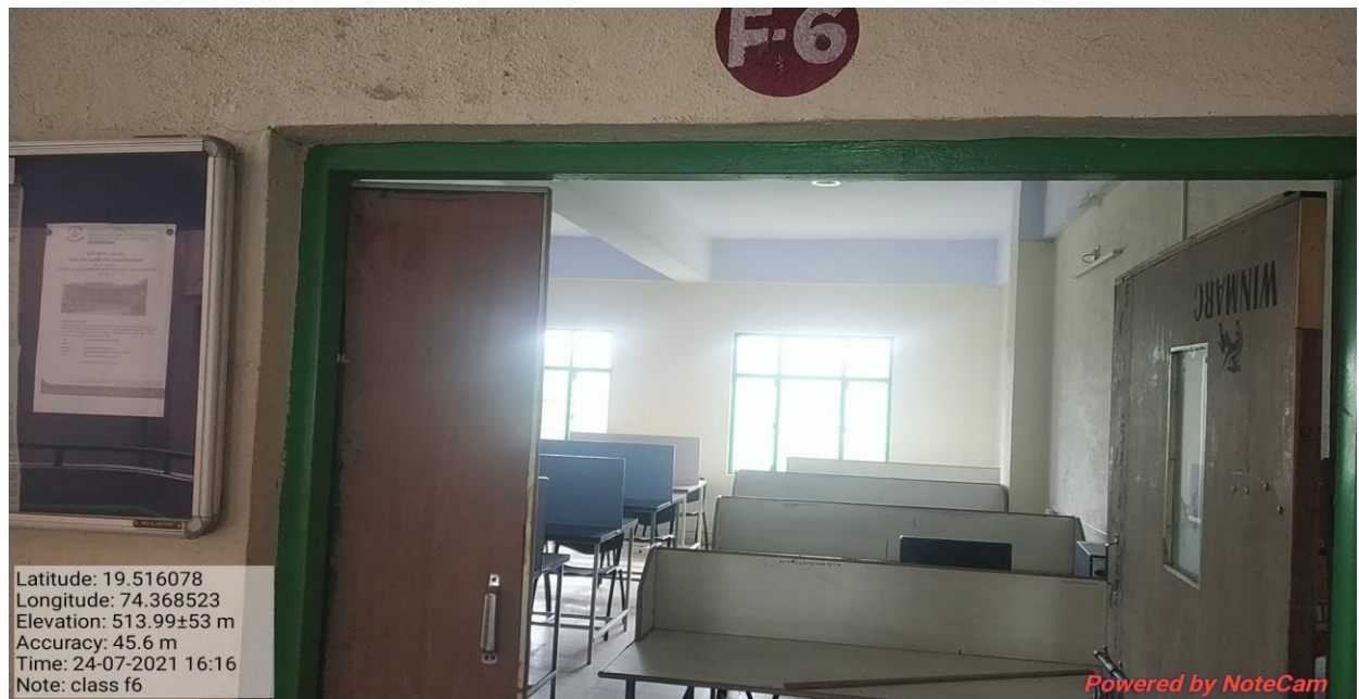
Class – F6