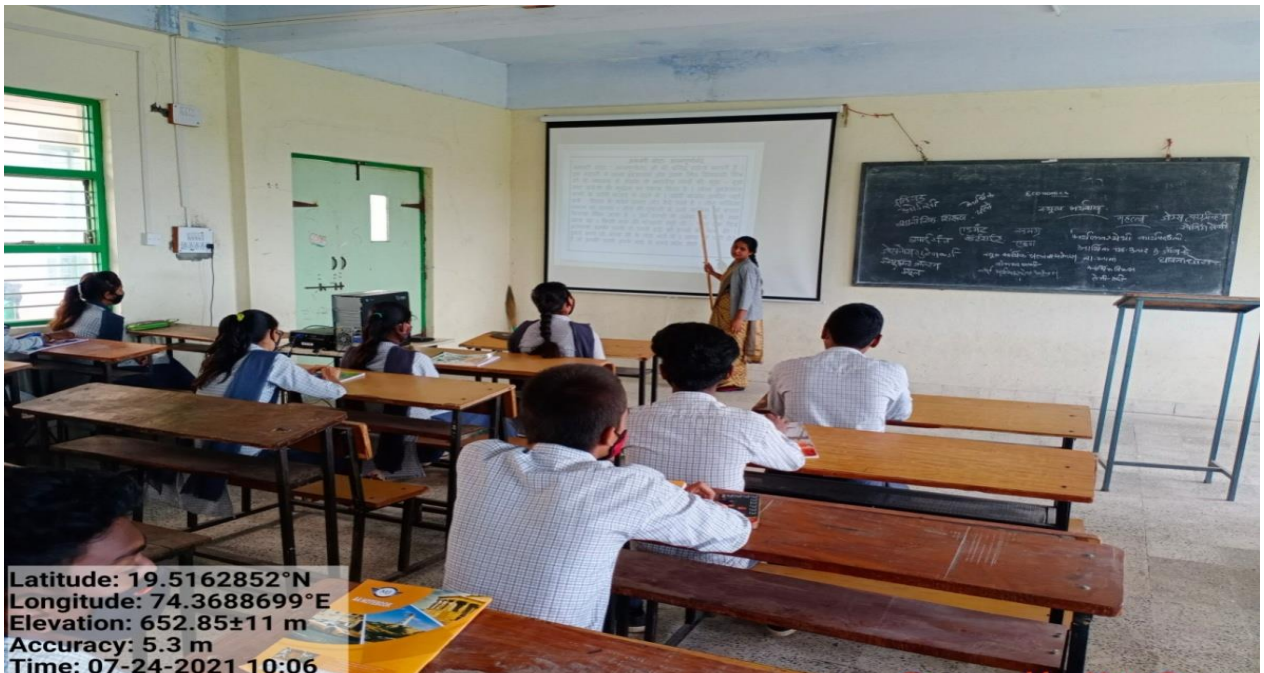
ICT- Classroom- Block No- S-6 (Second floor)-24/08/2019

Latitude: 19.5162852°N Longitude: 74.3688699°E Elevation: 652.85±11 m Accuracy: 5.3 m Time: 07-24-2021 10:06