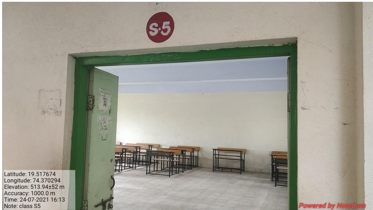
Class – S-5