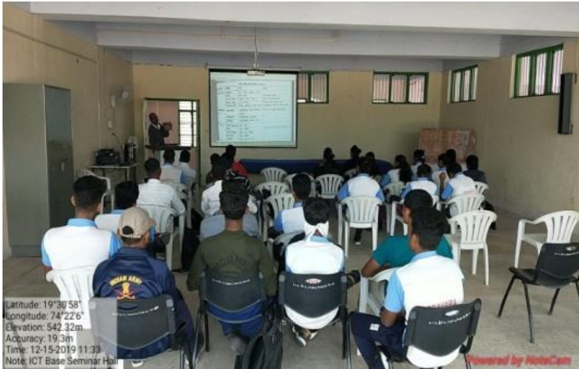
ICT- Seminar Hall- F-3 (First Floor)-15/12/2019