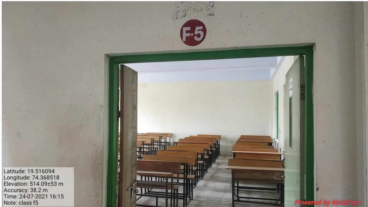
Class – F5