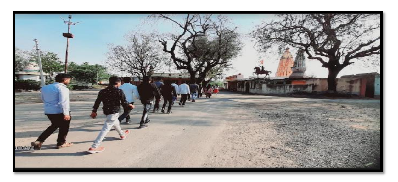
Awareness Rally conducted for Social Awareness

The 50 girls and boys Volunteers and 04 teachers initially participated in Program.