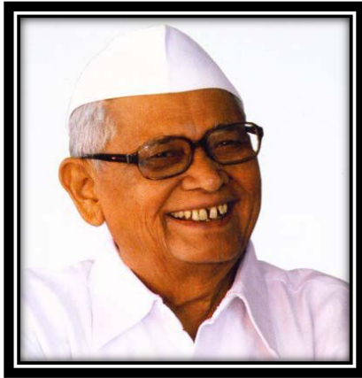
Late Dr. Balasaheb Vikhe Patil (Padmabhushan Awardee)