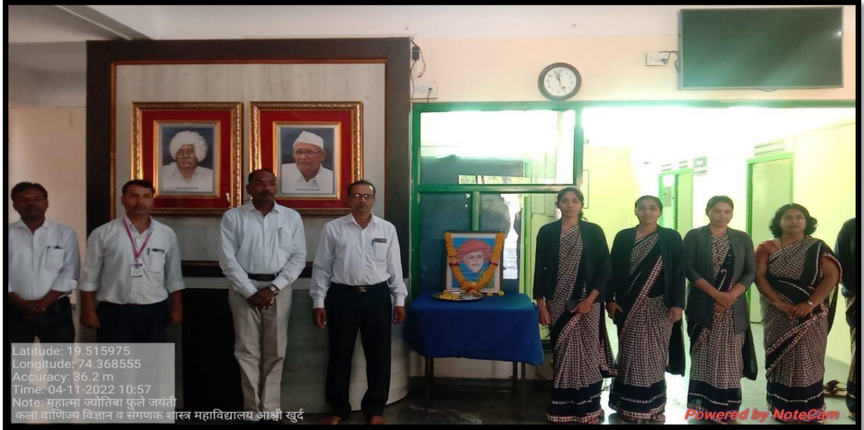
Mahatma Jyotiba Phule Birth Anniversary (11/04/2022)