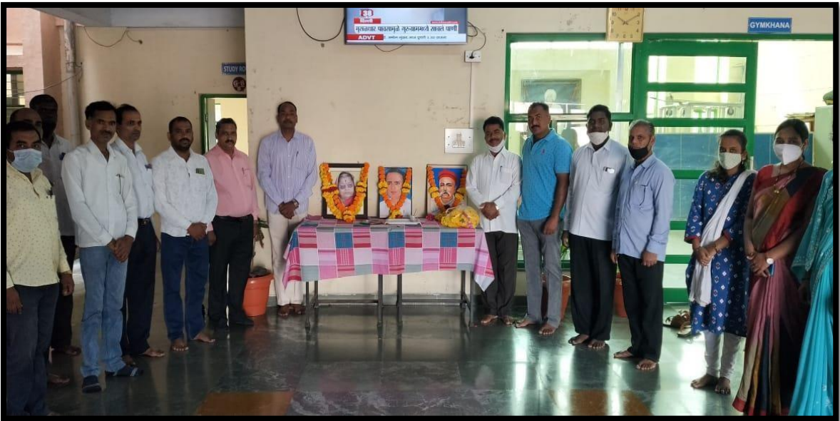
Annabhau Sathe Birth Anniversary (01/08/2021)