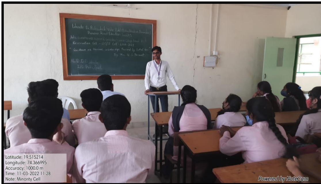
Guidance on various scholarships by minority Cell (11/03/2022)