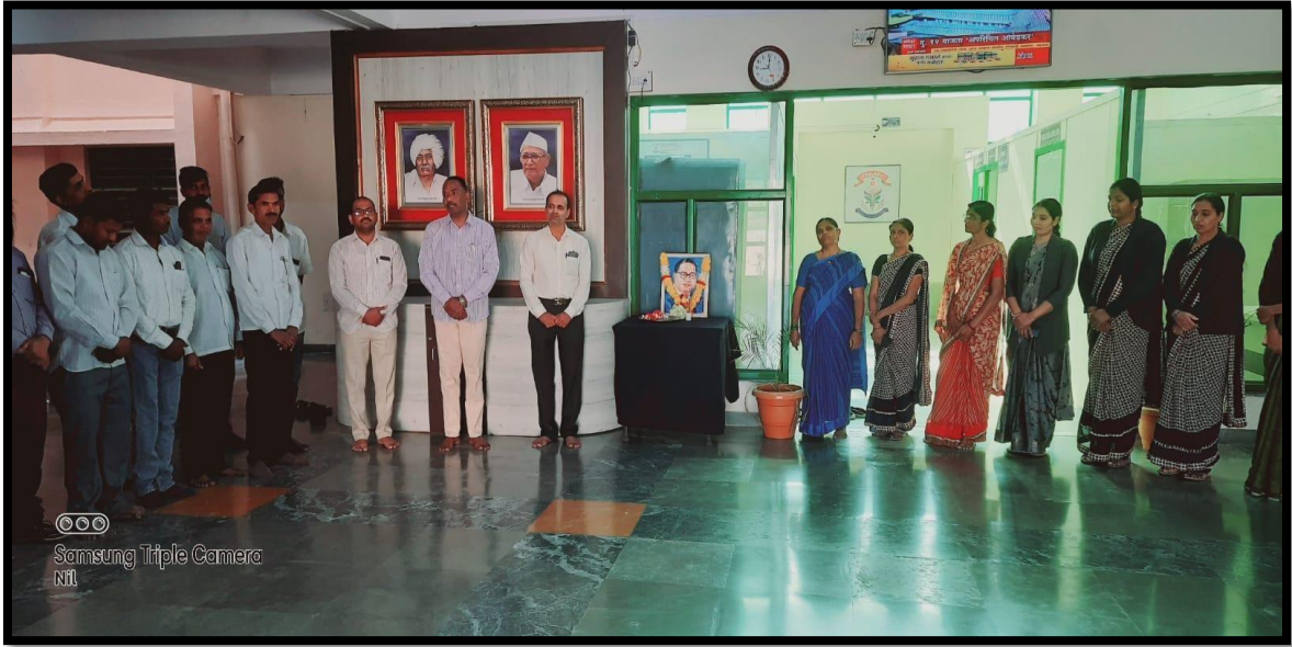
Dr. Babasaheb Ambedkar Death Anniversary (30/12/2021)