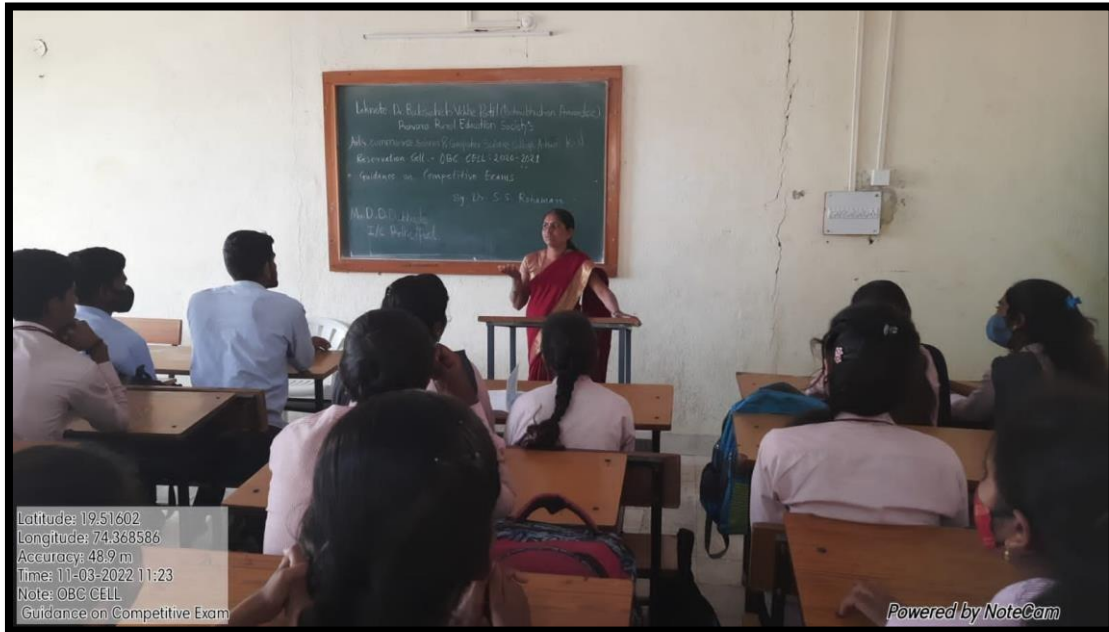
Guidance of Competitive exam by OBC Cell (11/03/2022)